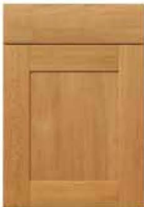
Rutland Oak Shaker